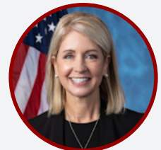
Rep. Mary Miller